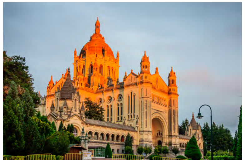
Basilica of Sainte-Therese

Overnight: Mont St. Michel (Breakfast, Dinner)